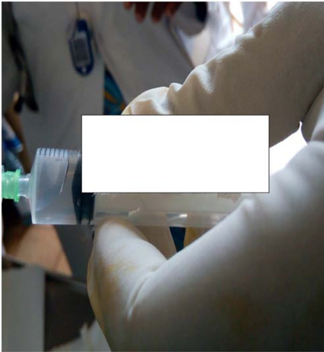
Figure 4. Control CSF.