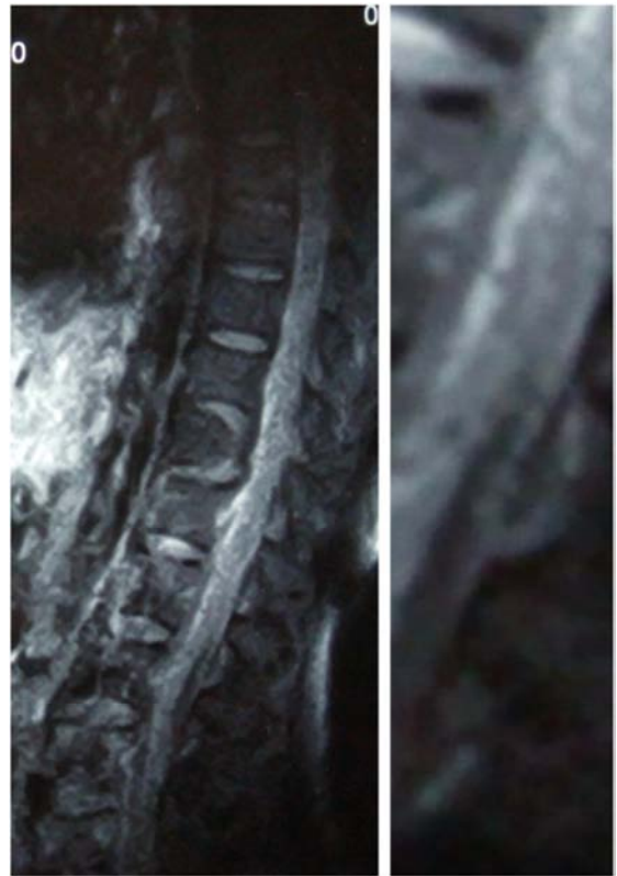
Figure 3. Dorsolumbar epiduritis with abscess opposite L3 and a posterior abnormality of the closure of the vertebral body of D11 allowing communication of D10-D11 and D11-D12 discs. The enlargement shows an abscess at L3.

Medullary MRI, performed one week after admission, has shown a dorsolumbar epiduritis with abscess opposite L3 and a posterior abnormality of the closure of the vertebral body of D11 allowing communication of D10-D11 and D11-D12 discs. (Figure 3).